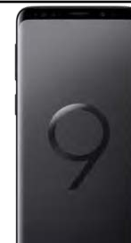
0 EUR Samsung S9 Dual SIM