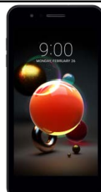
17.41 EUR LG K9