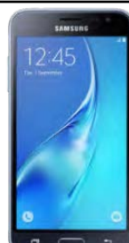
0 EUR Samsung Galaxy J3 Dual SIM