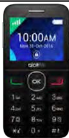
de la 7.97 EUR Alcatel 2008 Senior

Telefoane in limita stocului. Traficul internet ce poate fi consumat in roaming SEE se calculeaza dupa formula reglementata UE.