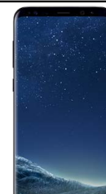
de la 12.59 EUR Samsung S8