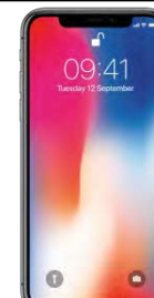
343 EUR Iphone XS 64 GB