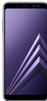
Samsung A8 DUAL SIM 2018 0 EUR

Ab. 10.1 EUR + Ab. 10.1 EUR + Ab. 10.1 EUR =