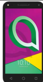
0 EUR Alcatel U58GB Dual SIM