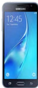
Samsung J3 DUAL SIM 0 EUR