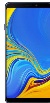
Samsung A9 DUAL SIM 2018 0 EUR

Ab. 10.1 EUR + Ab. 10.1 EUR + Ab. 10.1 EUR =