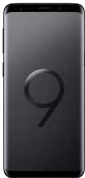
Samsung S9 64 GB 0 EUR