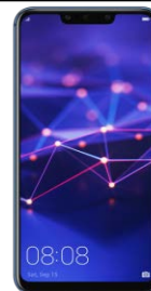
0 EUR Huawei MATE 20 LITE Dual SIM