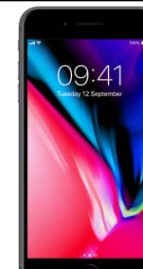
264 EUR Iphone 8 64 GB