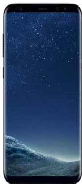
Samsung S8 de la 12.59EUR