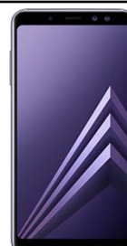
0 EUR Samsung A8 Dual SIM