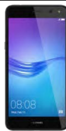
0 EUR Huawei Y6 Dual SIM 2018